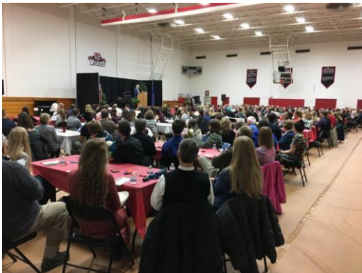
Over 300 students, guests and donors attended the 2018 Scholarship Awards Ceremony on May 22, 2018 in the field house.

For more information about the 2018-19 scholarship winners or to make a donation for a scholarship, please visit www.wccf-wi.org and click on the scholarship tab or the donate now tab.