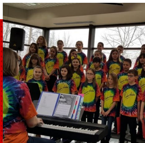
The Jackson Jingers, a student music group was one of many who entertained full audiences in the cafeteria throughout the day.